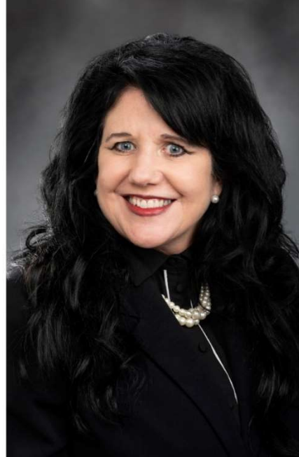
Sen. Mike Padden, ranking member on the Senate Law and Justice Committee Rep. Gina Mosbrucker, ranking member on the House Public Safety Committee